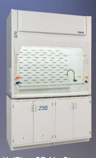
UniFlow SE AireStream High Performance Energy Efficient Laboratory Fume Hoods